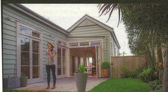
First place p4