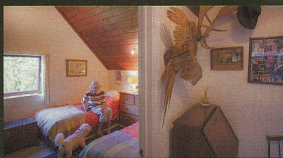
Megson townhouse p5

Imagine what you could do if you won back your home loan repayments for a year.